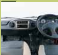
INJECTION MOLDED IP WITH CENTRALISED SWITCH PLATE