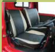
DUAL TONE SEAT