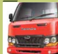
FRONT FASCIA GRILL, BUMPER