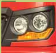
CLEAR LENSES HEADLAMPS