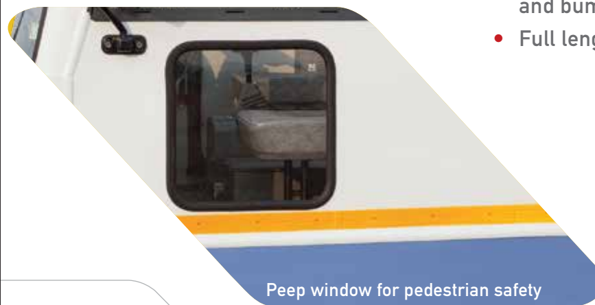
Peep window for pedestrian safety