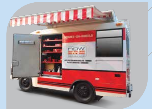
NOW mobile workshop