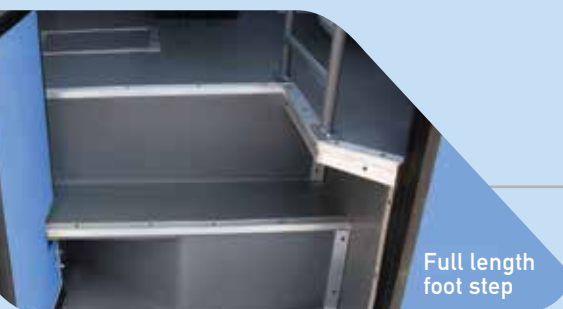
Full length foot step