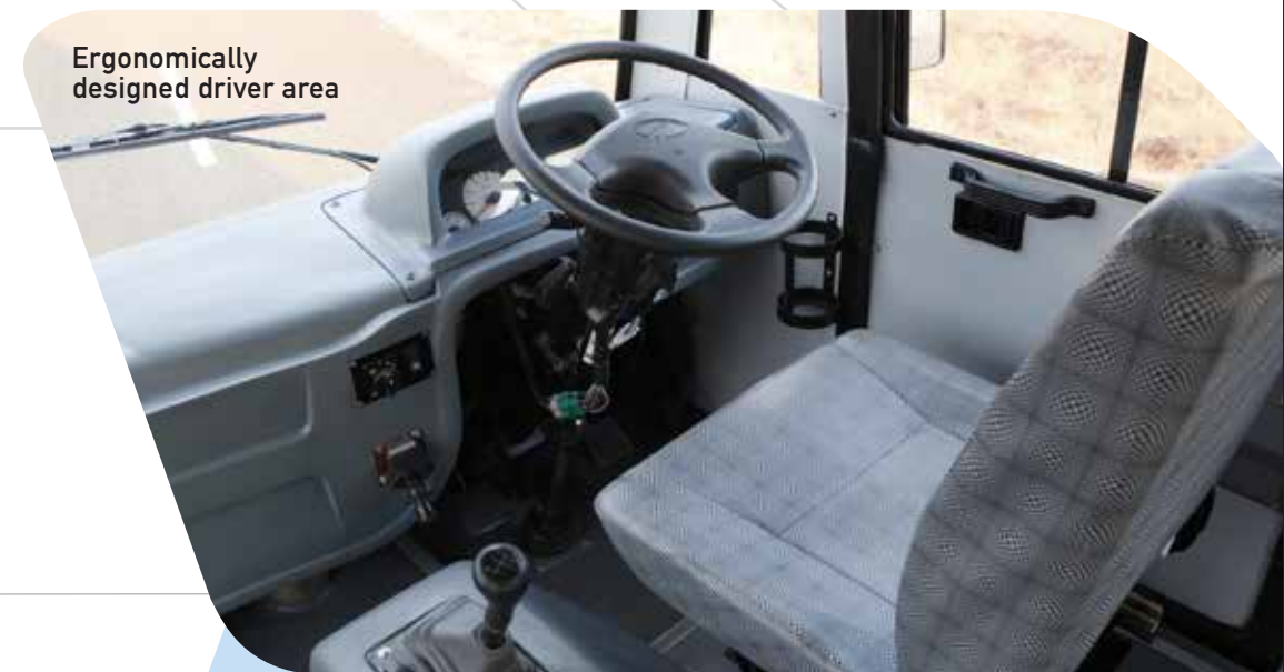
Ergonomically designed driver area