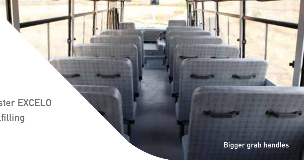
Bigger grab handles