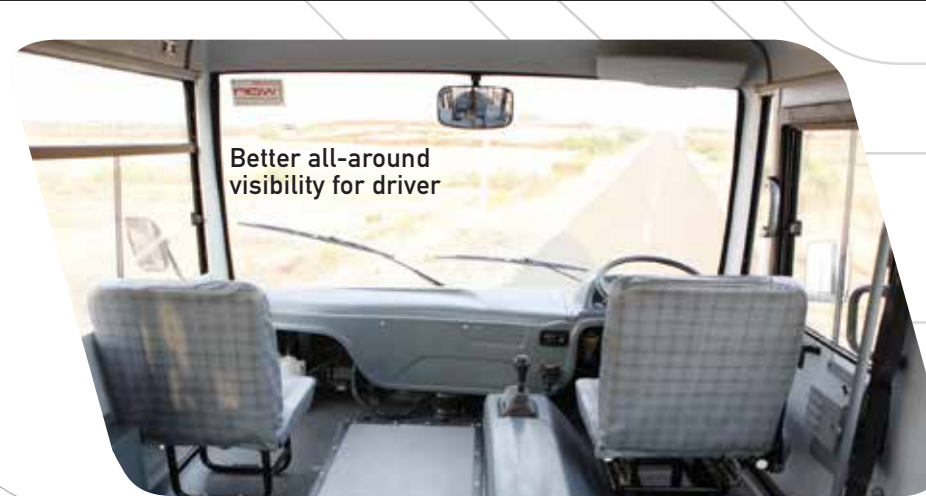
Better all-around visibility for driver