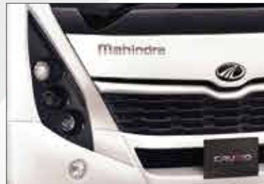
Projector Head Lamps