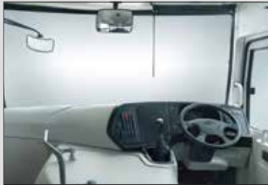
Well-ventilated Driver Compartment/Cockpit

The CRUZIO is designed with thoughtful features that strike the perfect balance to keep both passengers and the driver delighted.