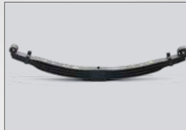
Best-In-Class Ride Comfort with Parabolic Suspension