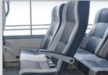
Comfortable Seat with Best-In-Class Seating Comfort