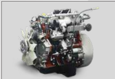
mDi Tech Engine