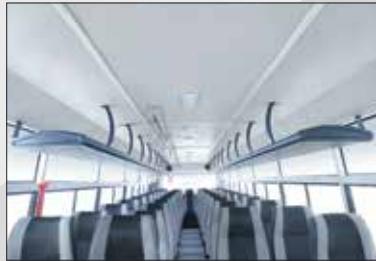
Roomy Interior for Pleasant Journey