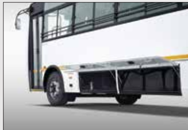
Side Luggage Booth