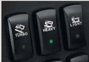
FuelSmart Technology for Best-In-Class Performance