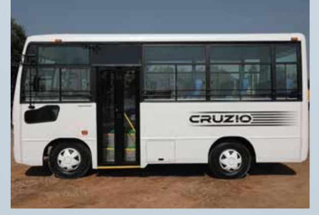
Rolled Roof Panel & Side Stretch Panel