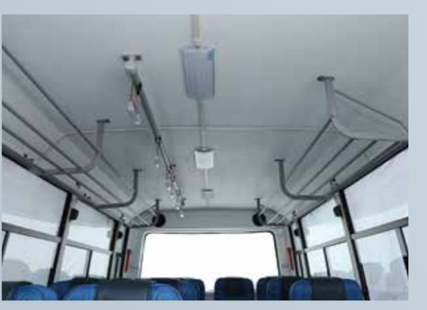
Roomy and Pleasant Interiors

A host of features ensures that the passengers are always comfortable in their seats and reach their workplace feeling fresh.