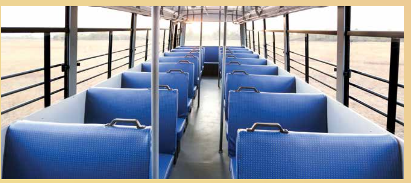
Seats Designed for Utmost Comfort