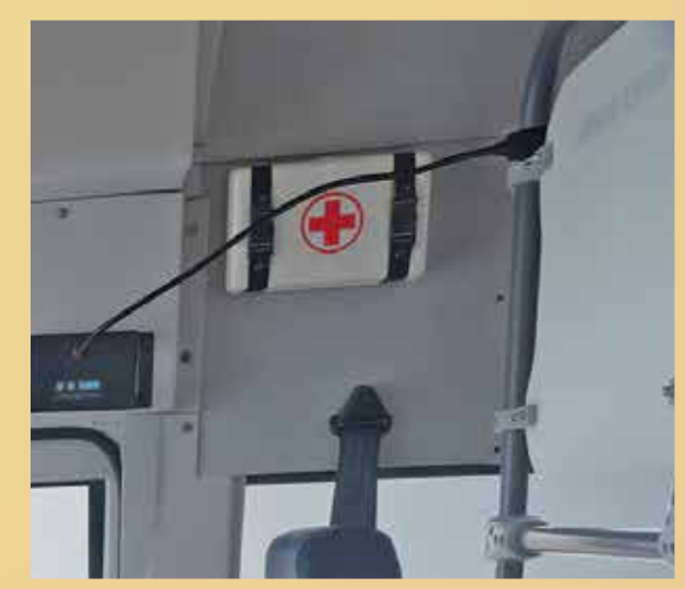
First Aid Box to keep Quick Medical Help always at hand