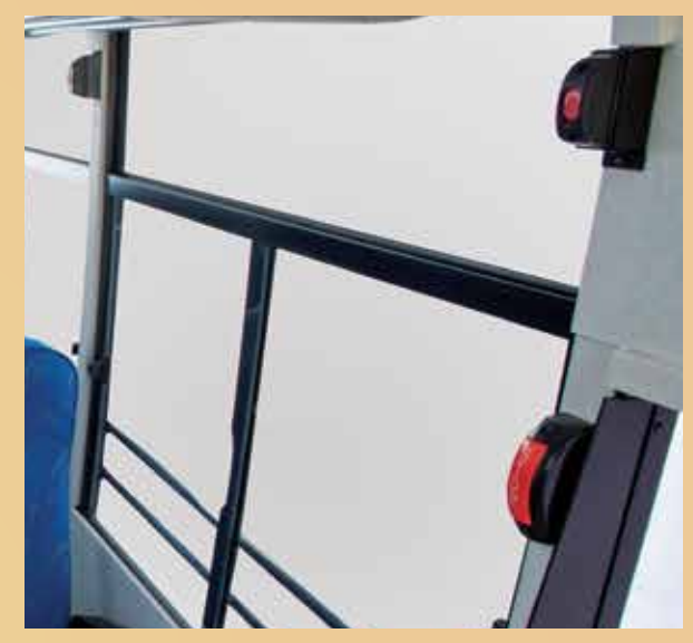
Emergency Button on each Seat Section