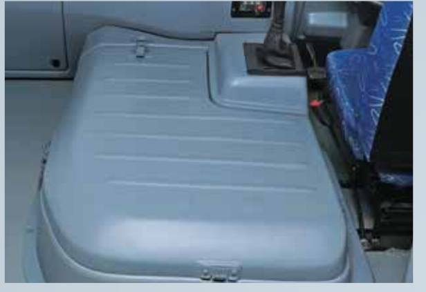
A Compact Engine Hood to make the Cabin More Spacious

These thoughtfully designed features make sure that the driver enjoys additional convenience all through the drive.