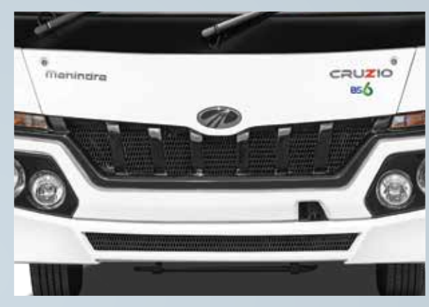
Front-openable Flap for Better Accessibility