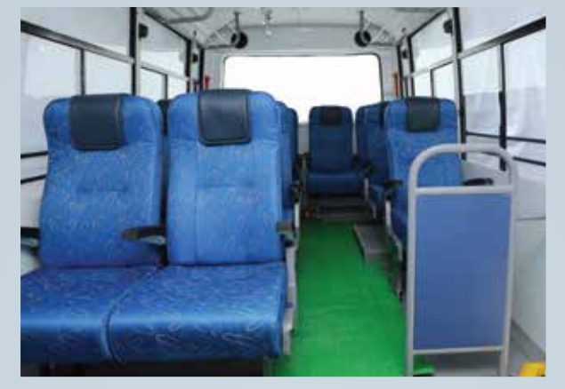
More Seating Capacity means More Profit for Owner