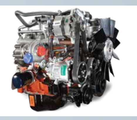
Trusted 2.5 litre mDi Engine with Best-In-Class Mileage

The Mahindra CRUZIO comes with a reliable mDi engine that's fully BS6 compliant and delivers more mileage on every trip.