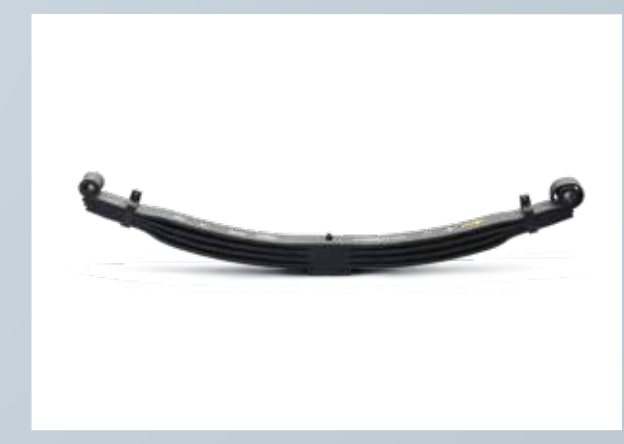
Parabolic Suspension with Anti-Roll Bar for Comfortable Ride and Stability