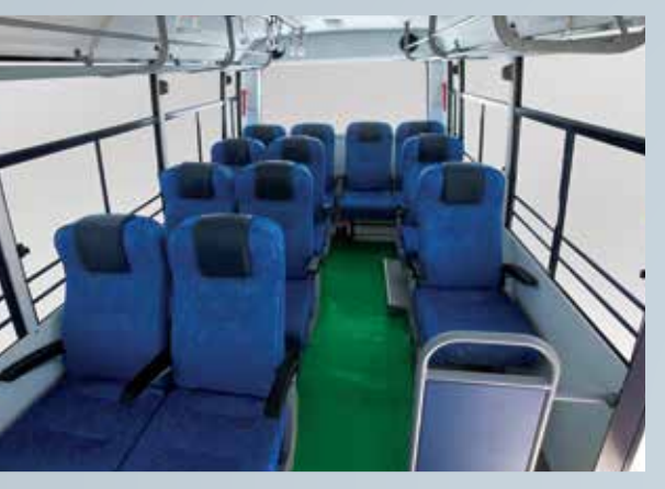
Wider Seats and Spacious Gangway

The Mahindra CRUZIO is thoughtfully designed to enhance comfort for the driver and the passengers too.