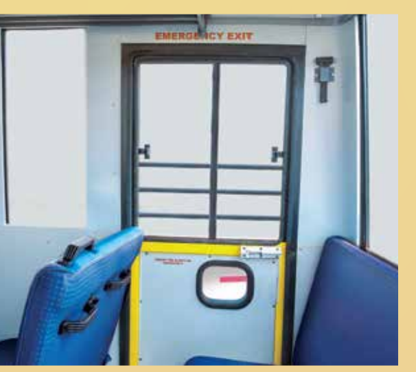
Emergency Exit for Quick Evacuation in Case of Exigency