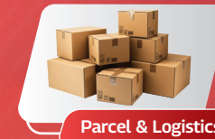
Parcel & Logistics