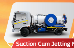
Suction Cum Jetting Machine