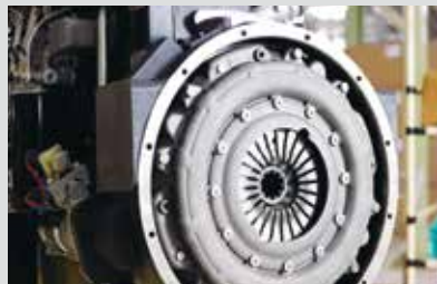
REFINED CLUTCH SYSTEM