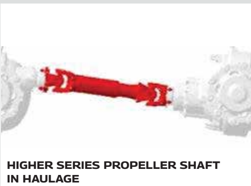
HIGHER SERIES PROPELLER SHAFT IN HAULAGE