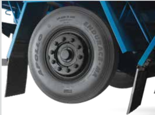
LIFT AXLE WITHOUT FULL LOAD