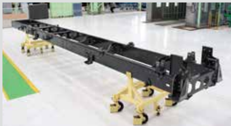
STRONGER CHASSIS FRAME