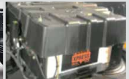
HIGHER CAPACITY BATTERY