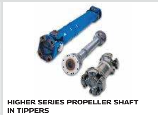
HIGHER SERIES PROPELLER SHAFT IN TIPPERS