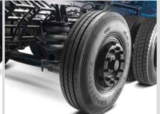
LIFT AXLE WITH FULL LOAD