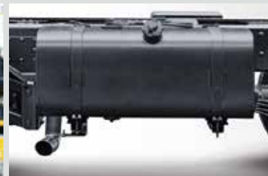
BIGGER HDPE DIESEL TANK