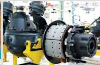
EFFECTIVE BRAKING SYSTEM