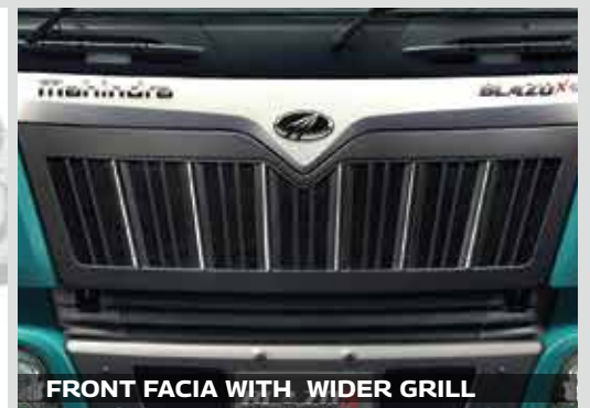
FRONT FACIA WITH WIDER GRILL