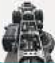
BODY SIZE/ LOADING SPAN