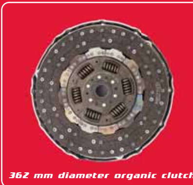
362 mm diameter organic clutch