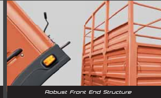
Robust Front End Structure