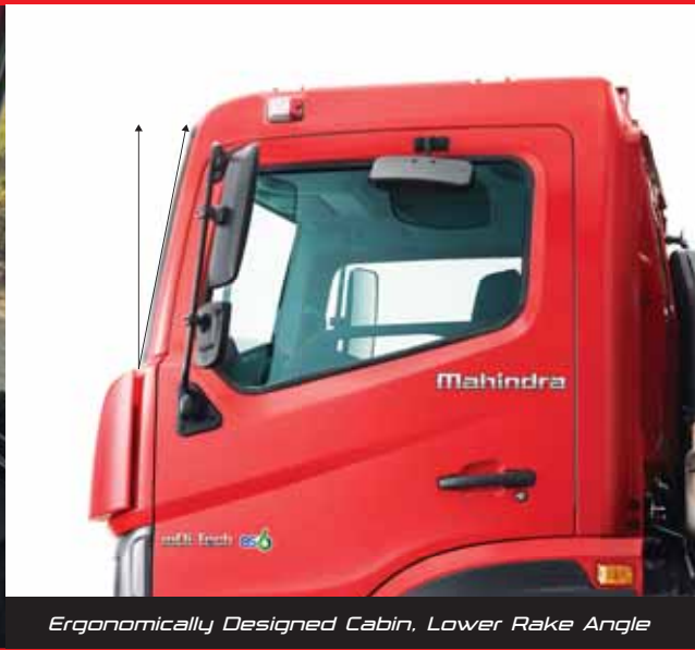
Ergonomically Designed Cabin. Lower Rake Angle