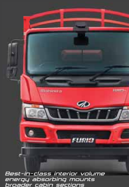
Best-in-class interior volume energy absorbing mounts broader cabin sections