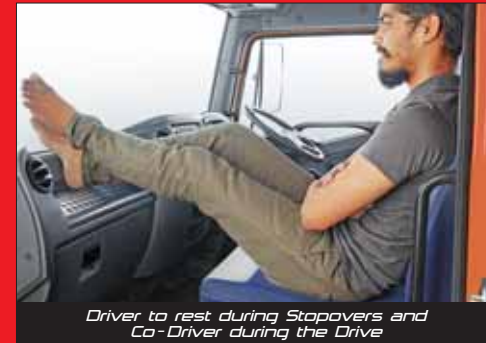
Driver to rest during Stopovers and Co-Driver during the Drive