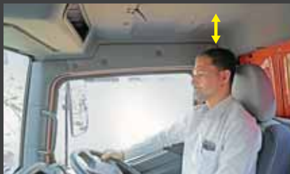
Perfect for Indian Road Conditions. Provides Better Comfort and Safety to Drivers.