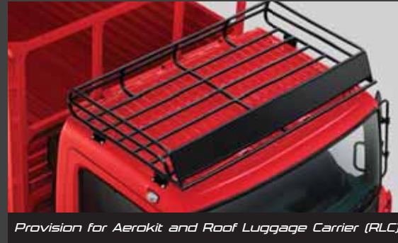
Provision for Aerokit and Roof Luggage Carrier (RLC)

READY TO USE FROM DAY ONE. EASY TO MODIFY FOR ANY APPLICATION.