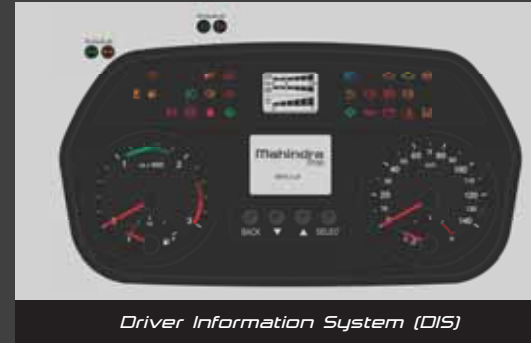
Driver Information System (DIS)