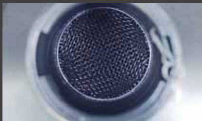
Wire Mesh for Fuel Theft Protection