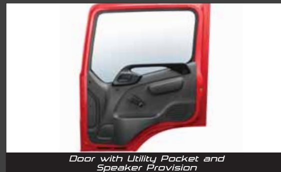
Door with Utility Pocket and Speaker Provision