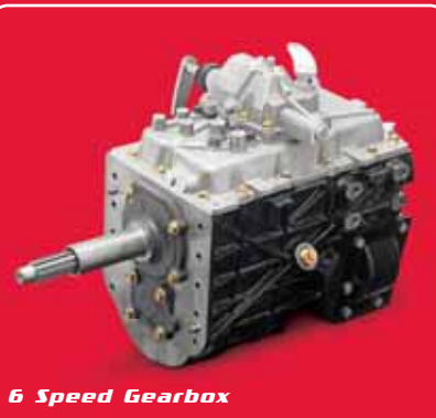
6 Speed Gearbox