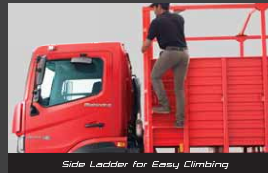
Side Ladder for Easy Climbing

MULTIPLE BODY LENGTH OPTIONS | PANELS WITH HSLA (HIGH - STRENGTH LOW - ALLOY STEEL) 420 MATERIAL | ADEQUATE SUPER STRUCTURE HEIGHT | DENSE PITCHSIDE PILLARS ROBUST STRUCTURE