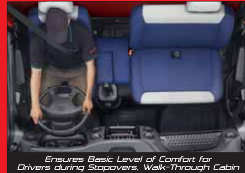
Ensures Basic Level of Comfort for Drivers during Stopovers. Walk-Through Cabin