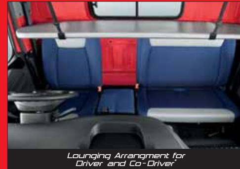
Lounging Arrangement for Driver and Co-Driver