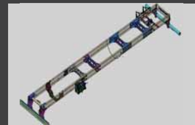
HSLA Chassis for Better Strength