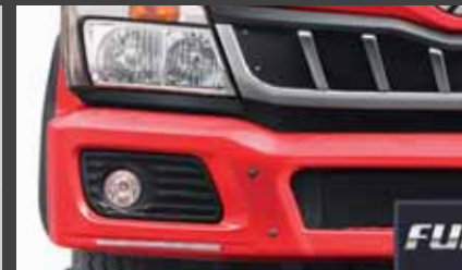
Dual Chamber Headlamps and Wide Spread Fog Lamps for Better Night Vision and Around Turns