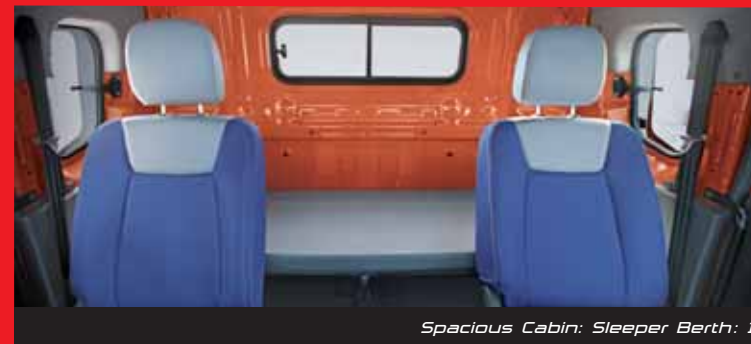
Spacious Cabin: Sleeper Berth: 1750 mm X 500 mm. Easy Access