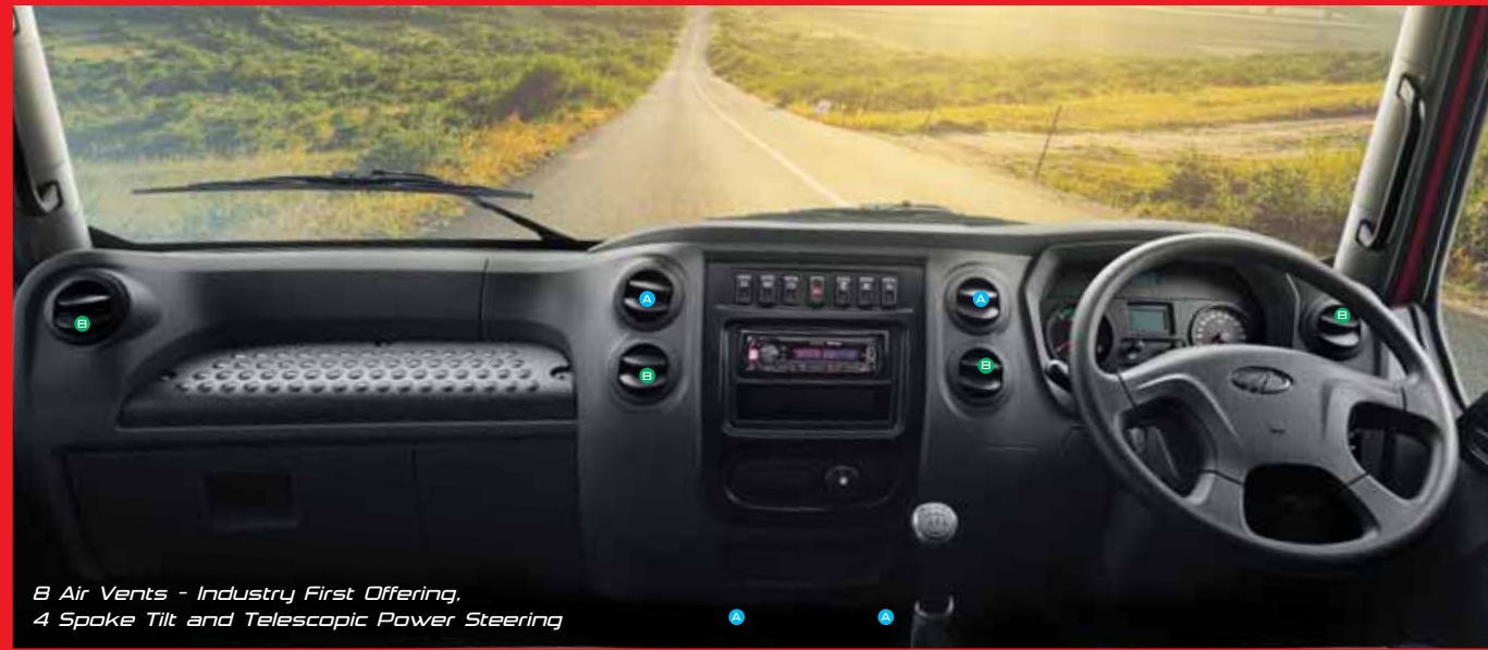
8 Air Vents - Industry First Offering. 4 Spoke Tilt and Telescopic Power Steering