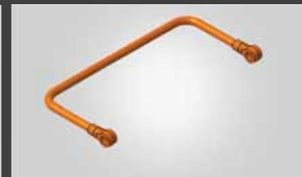
Anti-Roll Bar (ARB) for Better Stability