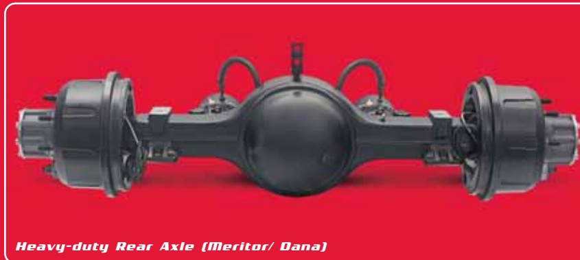
Heavy-duty Rear Axle (Meritor/ Dana)

MAHINDRA BS6 AFTER TREATMENT SYSTEM. LOWER AdBlue CONSUMPTION MEANS HIGHER EARNINGS.