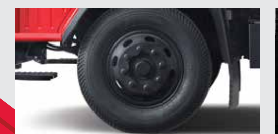
Tubeless and Radial Tyres* for High Speed Capacity, Better Stability And Puncture Resistance