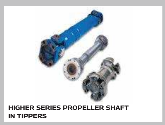
2055 series propeller shaft for better power transmission to drive axle. Rear-axle side end connection increased to T180 to maintain modularity due to common flange dia.