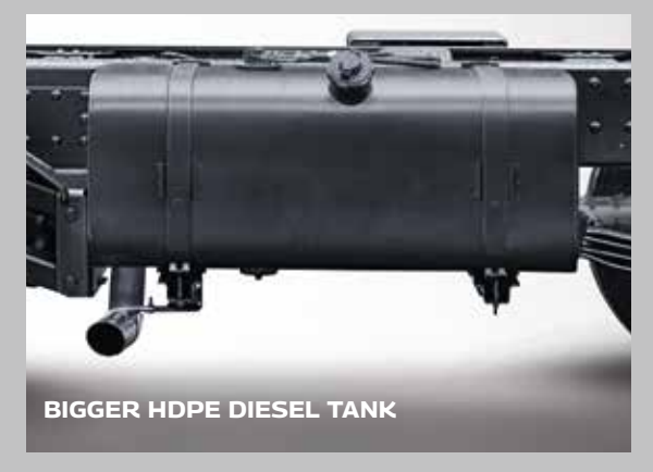
Holds up to 415 liter with ease (Highest Capacity in Mahindra BLAZO X series). Perfect for long haul operations.