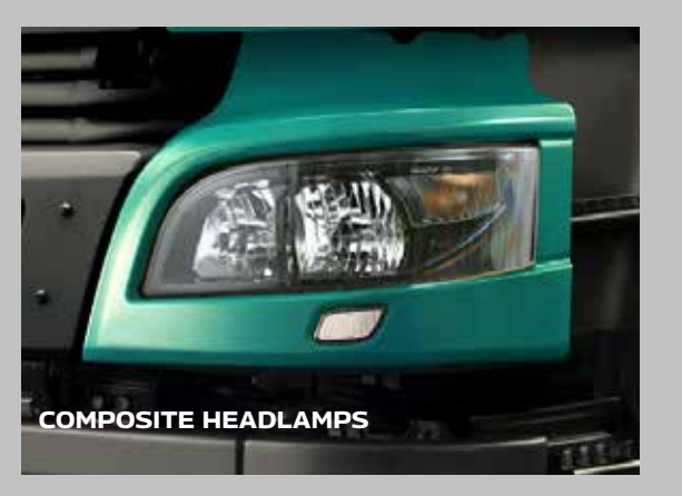
Gives better focal length and visibility while its filament remains intact and damage-free even on the roughest roads