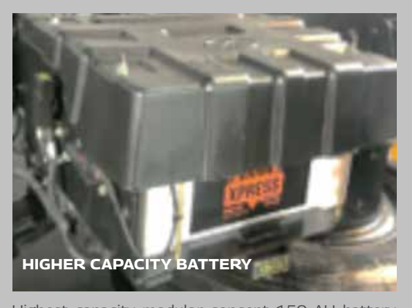
Highest capacity modular concept 150 AH battery that has a longer battery life in the Mahindra BLAZO X Series is perfect for all applications.