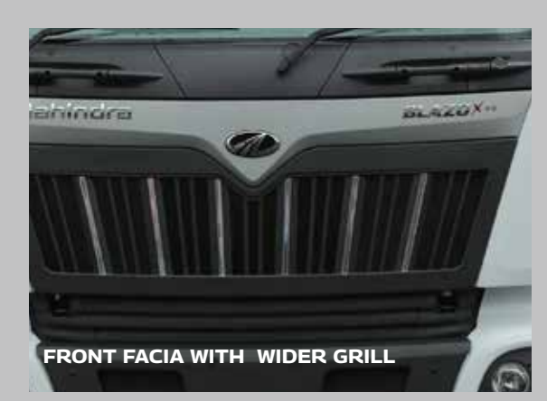
Wide spaced grills so air can enter easily and cool the radiator at all times