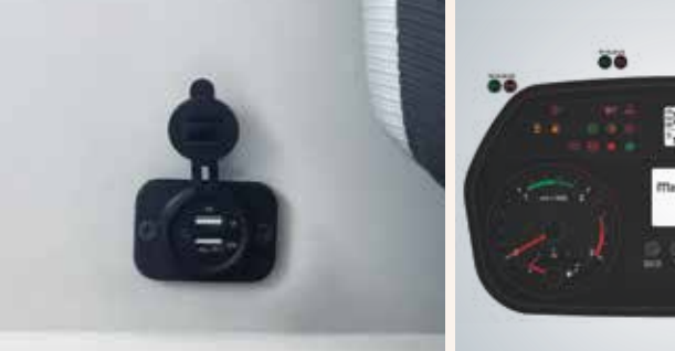
Dual Ports USB Charger for each Passenger