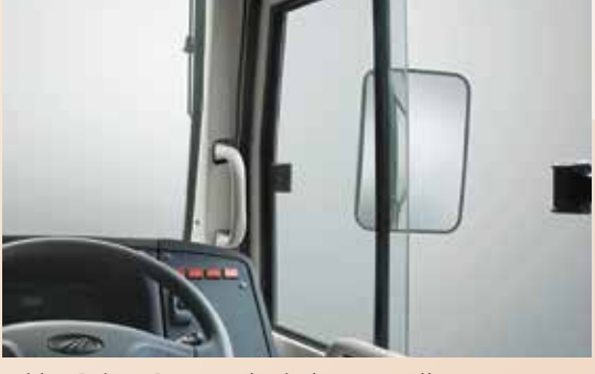
Wider Driver Door and Window as well as Foot Ventilation to Decrease Heat and Circulate Air Better for Driver