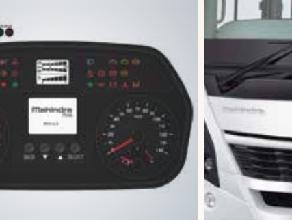
Driver-friendly Information System -Trip km and Air Pressure. Malfunction Indicators Help Prevent