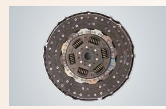
Bigger Clutch with Clutch Booster for Fatique-free Driving