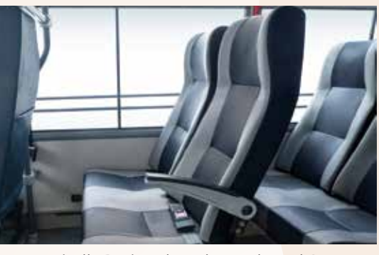
295 mm Roomy Legroom. Wide Seat Pitch - 680 Living Room mm. Maximum Seat Depth - 415 mm