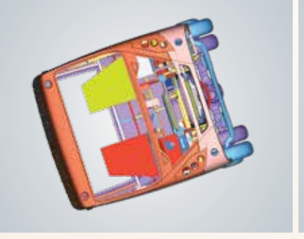
Rollover Compliant for Maximum Safety Biggest Brake Liners (325 mm x 155 Anti-Roll Bar for Better Stability for Passengers