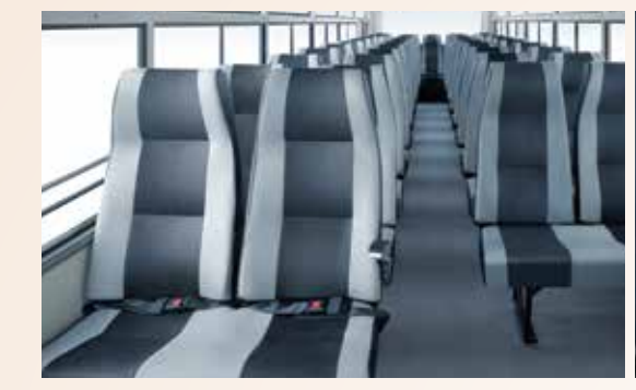
The Widest and Most Comfortable Seats to ensure Ergonomically Designed Lumbar and Head Support. Roomy and Well-Ventilated Saloon like a shoulders don't rub. Wide 910 mm Seats and Spacious Ganaway