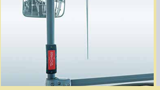
AIS140 Compliant and Emergency Button on each Pillar