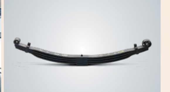
Softer Parabolic Suspension with Rubber Tips for Best-In-Class Comfort to Absorb Bumps and Jerks