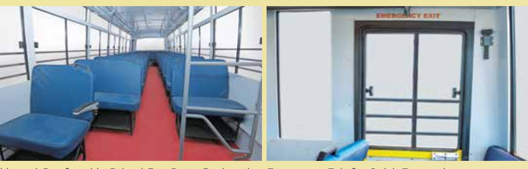
Wide and Comfortable School Bus Seats Designed Emergency Exit for Quick Evacuation for Maximum Safety and Convenience.