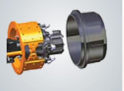
mm) for Reduced Stopping Distance