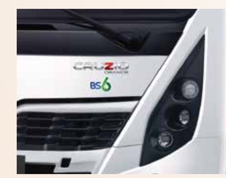
Projector Lamps for Better Brightness and Night Vision