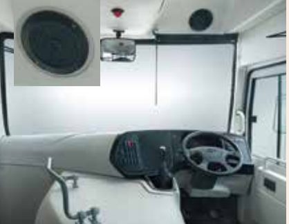
Speaker Mounting Provisions to Make Journeys Entertaining