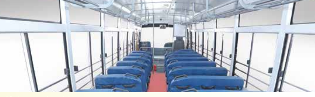
Modified Hat-Rack and Spacious Interior