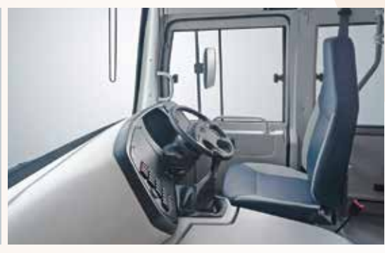
4-way Adjustable and Fully Reclining Driver's Seat Tilt and Telescopic Steering