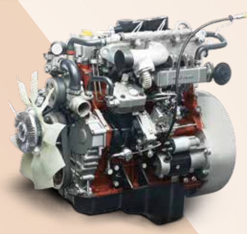
Proven mDi Tech Engine

This luxurious vehicle is powered by Mahindra's mDi Tech FuelSmart engine. The engine is powerful, super-efficient, low on friction, and comes with FuelSmart technology. But most importantly, it is backed by Mahindra's reputed CRDe expertise of more than a decade. This engine has an 1800 Bar Common Rail System and an Alternator Wastegate Turbocharger that together give you improved performance; by delivering a unique combination of higher power and higher fuel economy. A Hydraulic Lash Adjuster (HLA) means no more tappet setting every now and then. Same with the Auto Belt Tensioner which sets itself and requires no manual adjustments.