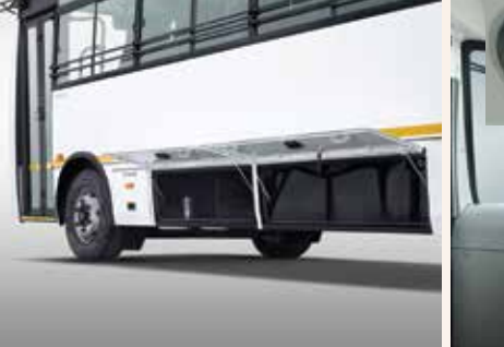
Downward Open-able Front Flap for Easy 40% More Luggage Space for Extra Convenience (690 litre overall space)