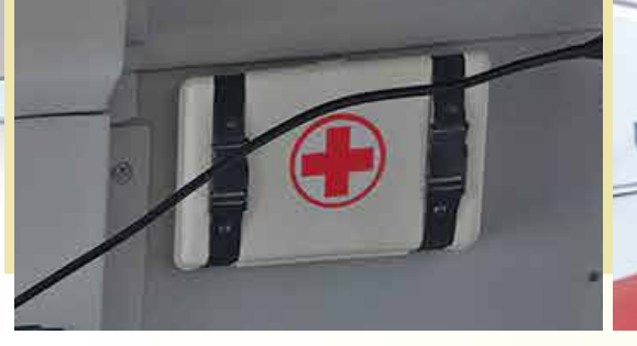
First Aid Box to keep quick Medical Help always at Hand