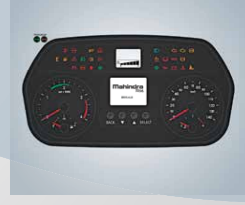
Advanced Driver Information System for Improved Trip Management

Front-openable Flap for Better Accessibility