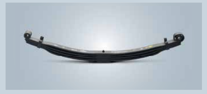
Parabolic Suspension with Anti-Roll Bar for Comfortable Ride and Stability

A host of features ensures that the passengers are always comfortable in their seats and reach their workplace feeling fresh.