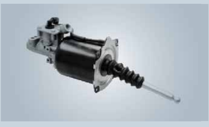
Heavy Duty Gearbox and Bigger Clutch integrated with Clutch Booster for Fatigue-less Driving