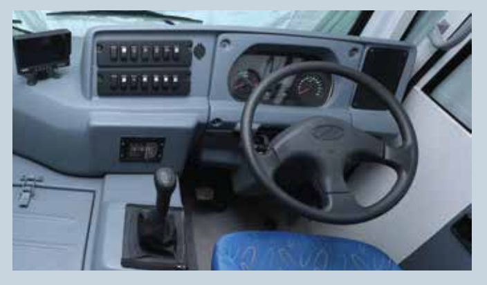
Tilt and Telescopic Steering