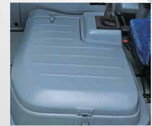
A Compact Engine Hood to make the Cabin More Spacious