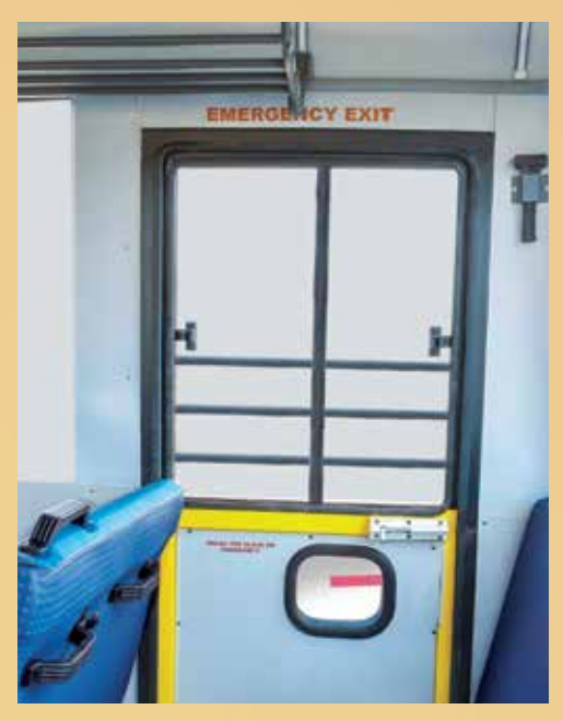
Emergency Exit for Quick Evacuation in Case of Exigency