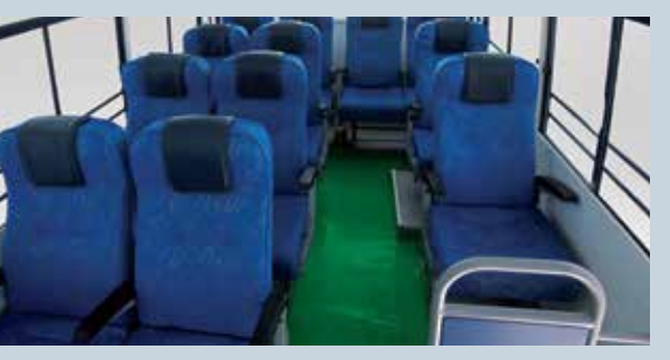
Wider Seats and Spacious Gangway

The Mahindra CRUZIO comes with a reliable mDi engine that's fully BS6 compliant and delivers more mileage on every trip.