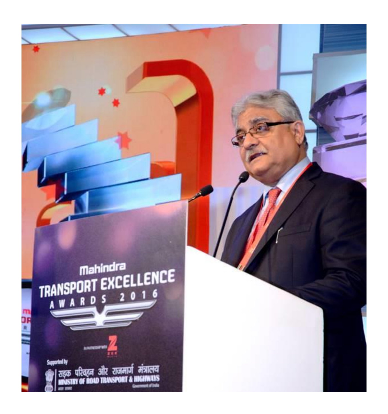
And then, the final RISE Moment!